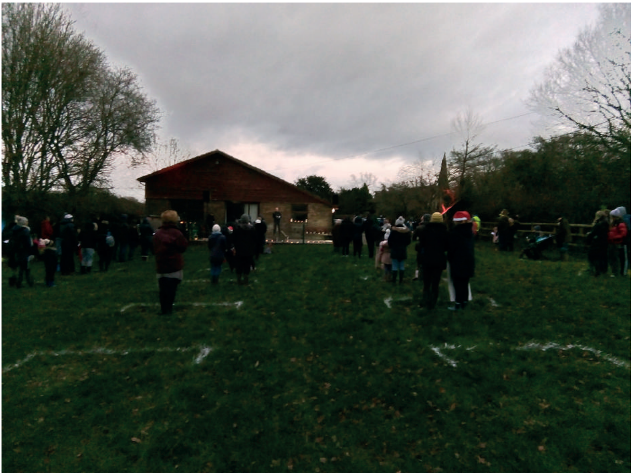
Thank you to everyone for the photos, please check out the website for more images of Barkham.