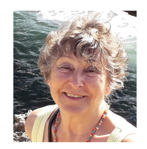
Arborfield Gardening Association