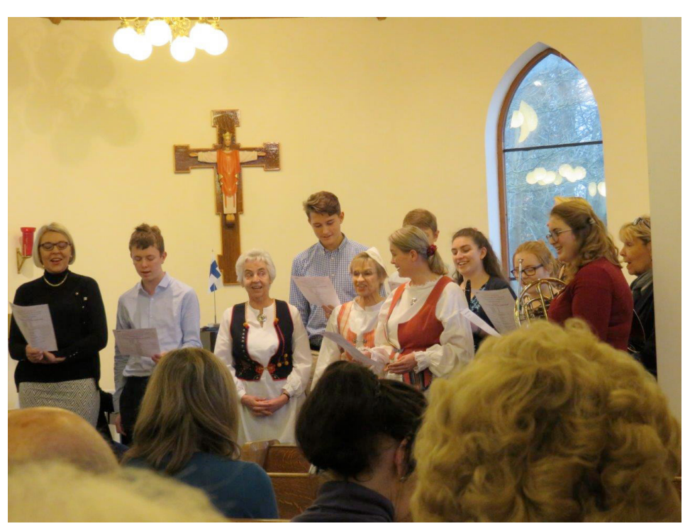
The December concert