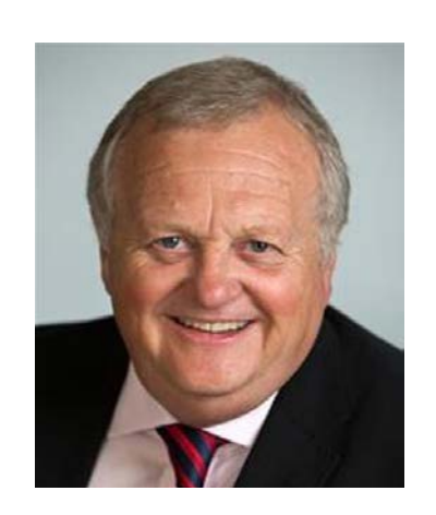
Councils budget 2022/23

This year's proposed budget is as you would expect is cautious, and I ampleased to say the council will not be cutting any services. We have tried to either keep fees and charges to a minimum or where possible, like car parking charges, not increased them to help the borough's economy recover. We will also prioritise social housing and look to deliver more homes at social rents, as even affordable housing is out of the reach for many in our borough who are on low incomes.