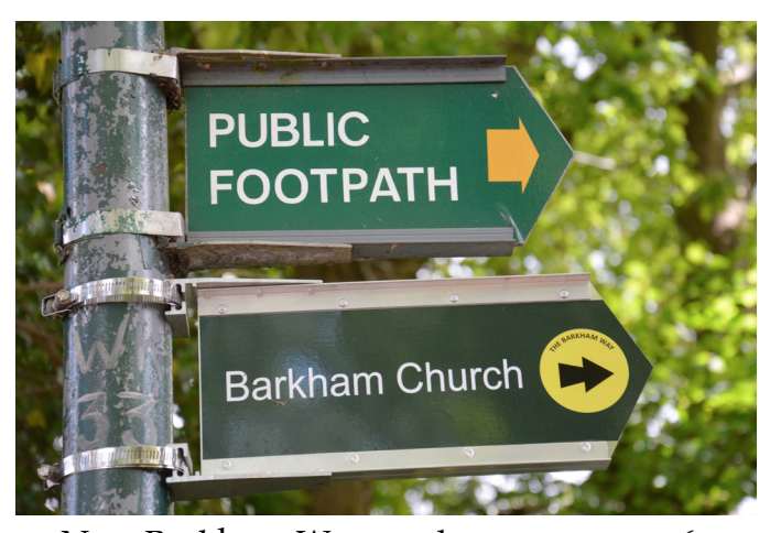
New Barkham Way markers – see page 6

Next Social Event Barn Dance 30 September From 7.00 - 10.00 pm in Barkham Village Hall with a live band and caller and includes a supper. £10 for adults and £5 for 16's and under. See page 10 for ticket info.