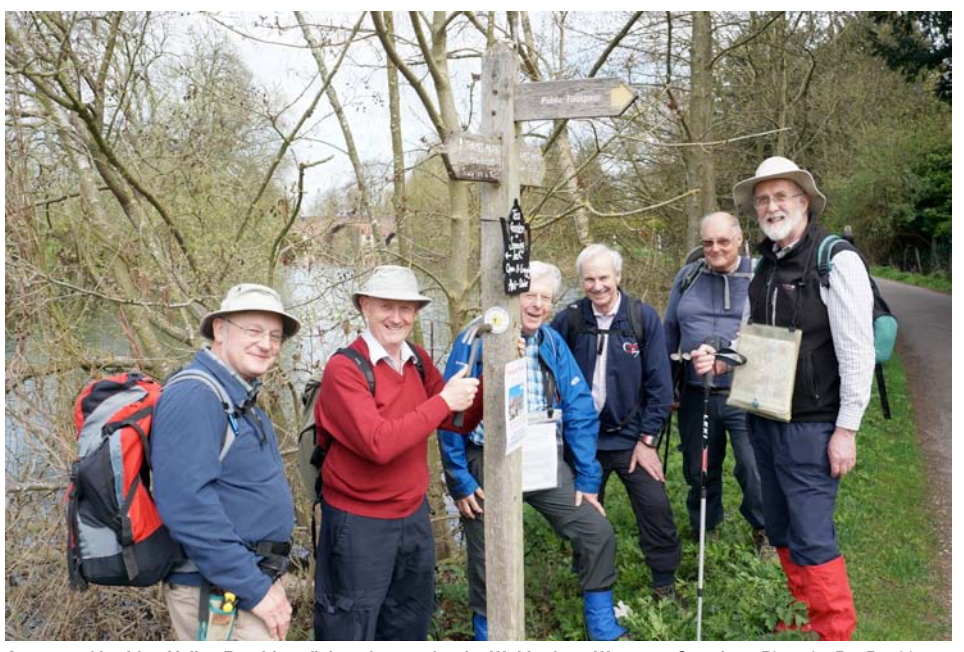
A group of Loddon Valley Ramblers fixing signage for the Wokingham Way near Sonning.

Thursday 22nd August: Fields &canal around Odiham, 4 miles. 10.30 from Odiham Wharf CP at the end of London Road off the High Street, near the Water Witch pub, (RG29 1AL).Leader –David M.07932 246232.