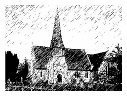
St James' Church