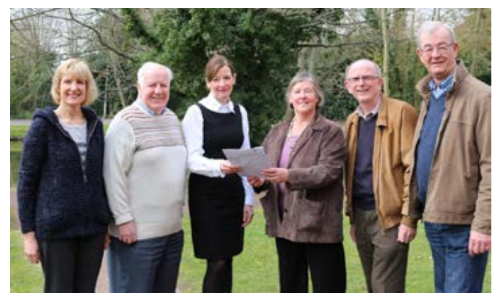
Handover of the Neighbourhood Plan application

new secondary School is not yet known but needs to be central for all Barkham, Arborfield and Finchampstead pupils.